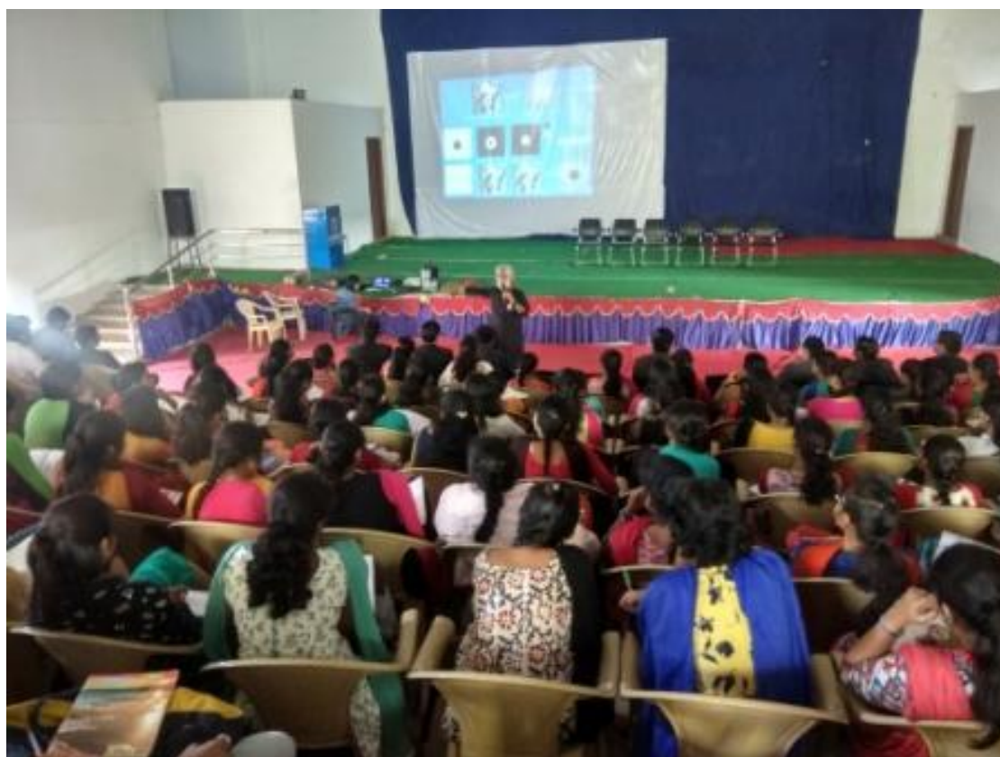
Code of Conduct for the faculties and non-teaching (Academic Year 2014-15) on 9/8/2014