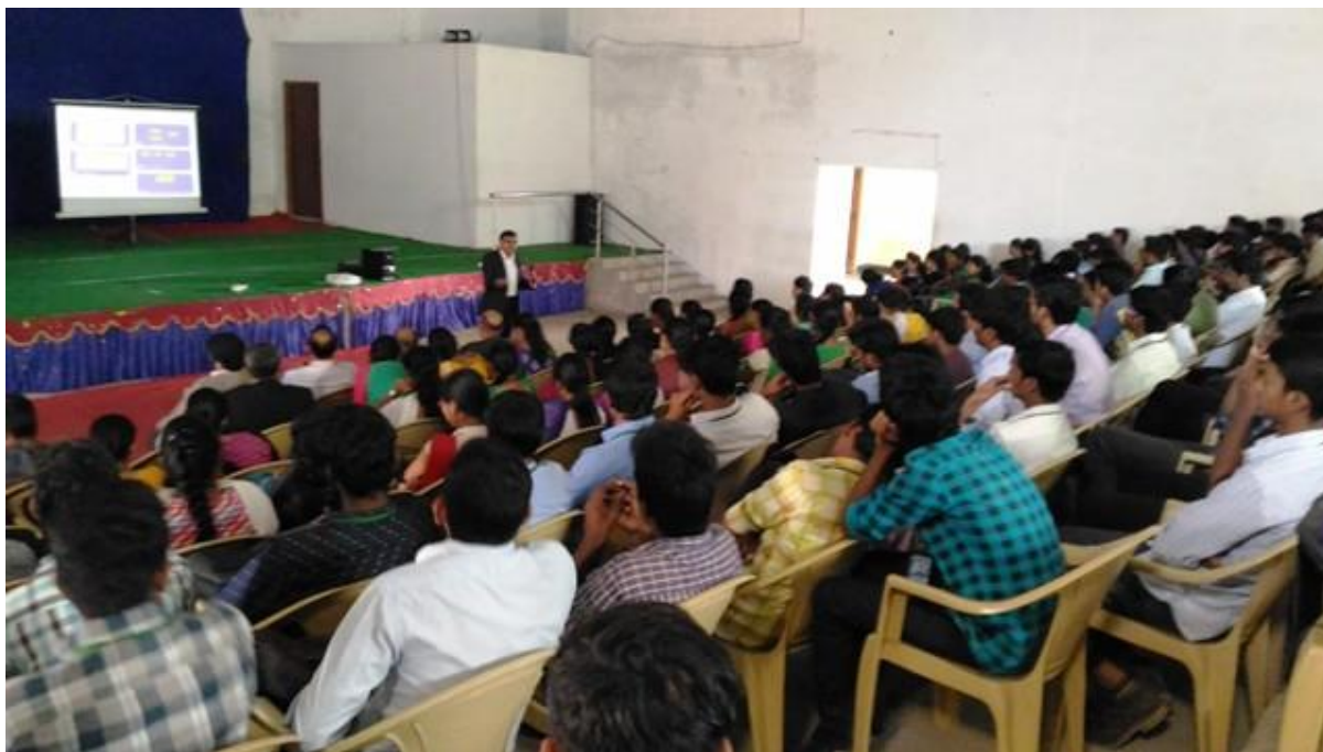
Fig.: Resource Person addressing the Administrative and other staff