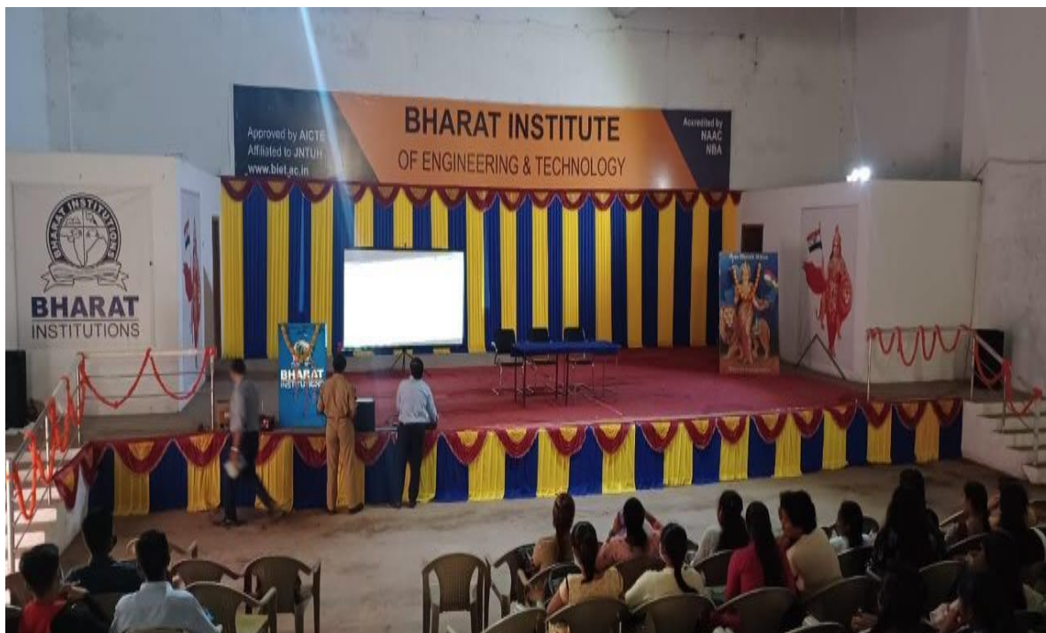
Resource Person addressing the gathering of Administrative and other staff on 9/1/2016