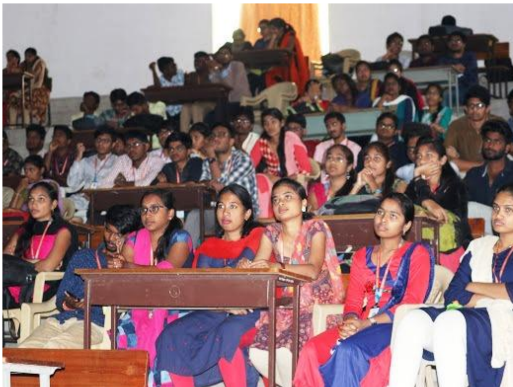
Faculties and non-teaching staff on “Professional Ethics and Code of Conduct for Faculties (AY 2014-15)”