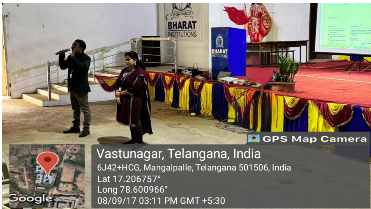
Speakers lecturing the faculties and non-teaching staff for the code of conduct program on 8/9/17