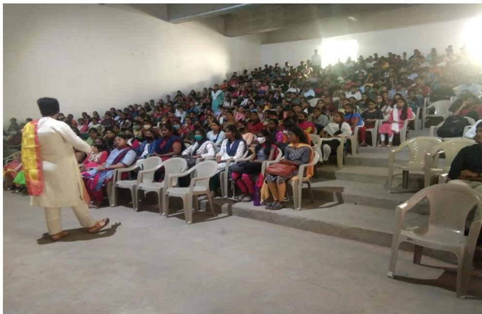
Resource persons and students for the “Code of Conduct for the students (Academic Year 2014-15)”