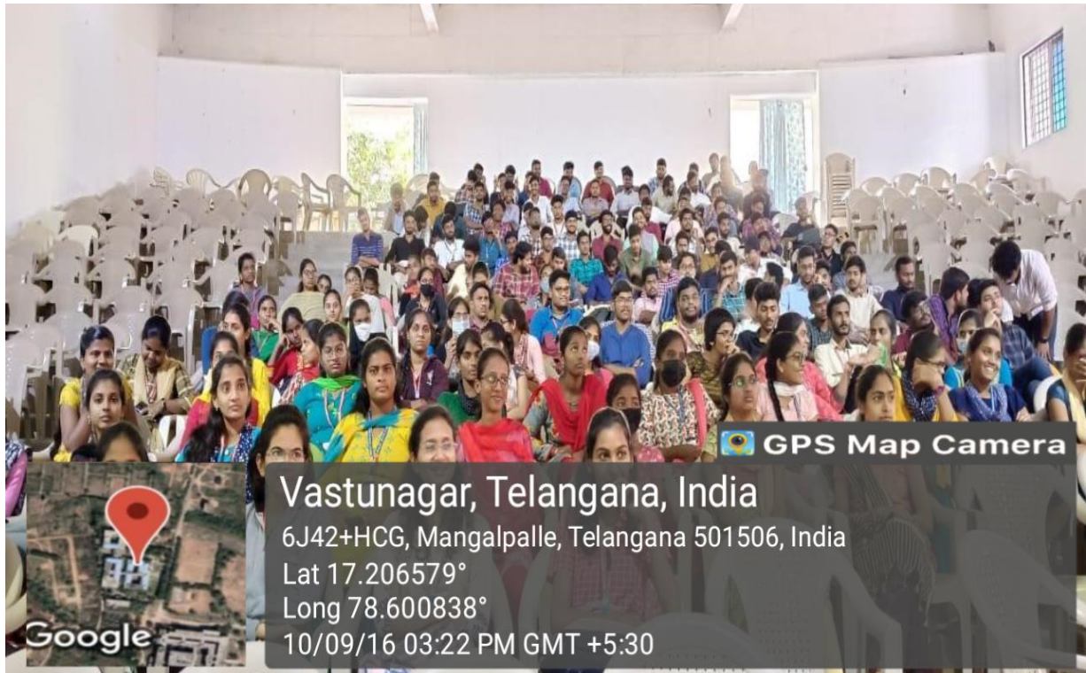
Students listening to the awareness Programme on “Code of Conduct for the students (Academic Year 2016-17)” on 10/9/16