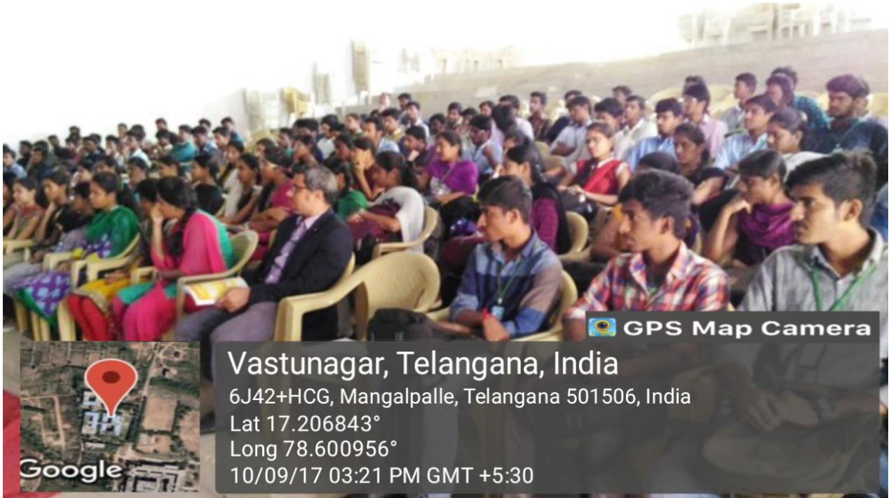
Students listening to the awareness Programme on “Code of Conduct for the students (Academic Year 2017-18)” on 10/9/17