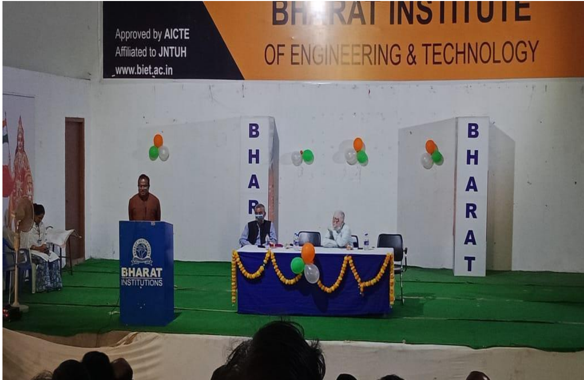
Honorable chairman sir addressing non-teaching staff for the code of conduct program on 14/8/2015