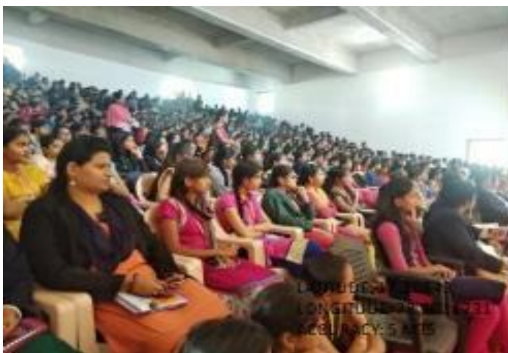
Present faculties and non-teaching staff for the code of conduct program