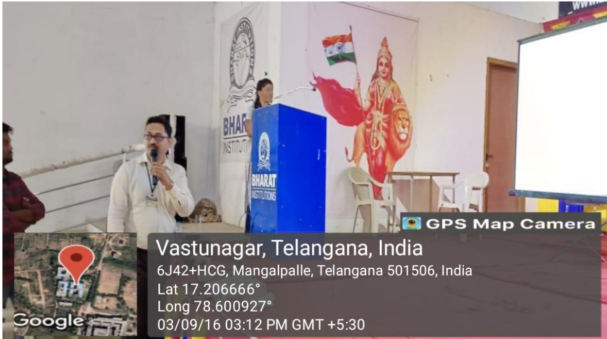
Speakers addressing the faculties and non-teaching staff for the code of conduct program on 3/9/16